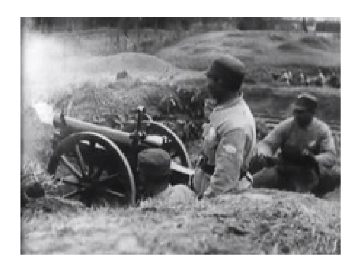
NRA troops firing artillery at Communist forces

In October 1934 the CCP took advantage of gaps in the ring of blockhouses (manned by the forces of a warlord ally of Chiang