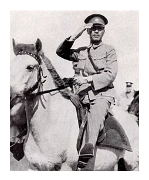
GeneralissimoChiang Kai-shek, Commander-in-Chief of the National Revolutionary Army, emerged from the Northern Expedition as the leader of the Republic of China.

quickly reoccupied Nanchang while the remaining members of the CCP in Nanchang went into hiding. A CCP meeting on 7 August confirmed the objective of the party was to seize the political power by force, but the CCP was quickly suppressed the next day on 8 August by the Nationalist government in Wuhan led by Wang Jingwei. On 14 August, Chiang Kai-shek announced his temporary retirement, as the Wuhan faction and Nanjing faction of the Kuomintang were allied once again with common goal of suppressing the Communist Party after the earlier split.