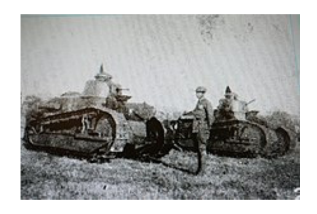
Chinese FT tanks

The capture of large KMT units provided the CCP with the tanks, heavy artillery and other combined-arms assets needed to execute offensive operations south of the Great Wall. By April 1948 the city of Luoyang fell, cutting the KMT army off from Xi'an. Following a fierce battle, the CCP captured Jinan and Shandong province on 24 September 1948. The Huaihai Campaign of late 1948 and early 1949 secured east-central China for the CCP. The outcome of these encounters were decisive for the military outcome of the civil war.