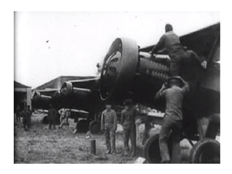
Nationalist warplanes being prepared for an air raid on Communist bases

This strategy enabled the CCP to access an almost unlimited supply of manpower for both combat and logistical purposes; despite suffering heavy casualties throughout many of the war's campaigns, manpower continued to pour in massively. For example, during the Huaihai Campaign alone the CCP was able to mobilize 5,430,000 peasants to fight against the KMT forces.