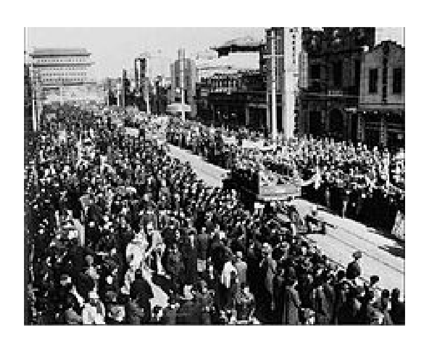
The PLA enters Beijing in the Pingjin Campaign.

As postwar negotiations between the Nationalist government in Nanjing and the Communist Party failed, the civil war between these two parties resumed. This stage of war is referred to in mainland China and Communist historiography as the "War of Liberation" (Chinese: 解放战争; pinyin: JiěfàngZhànzhēng). On 20 July 1946, Chiang Kai-shek launched a large-scale assault on Communist territory in North China with 113 brigades (a total of 1.6 million troops). This marked the first stage of the final phase in the Chinese Civil War.