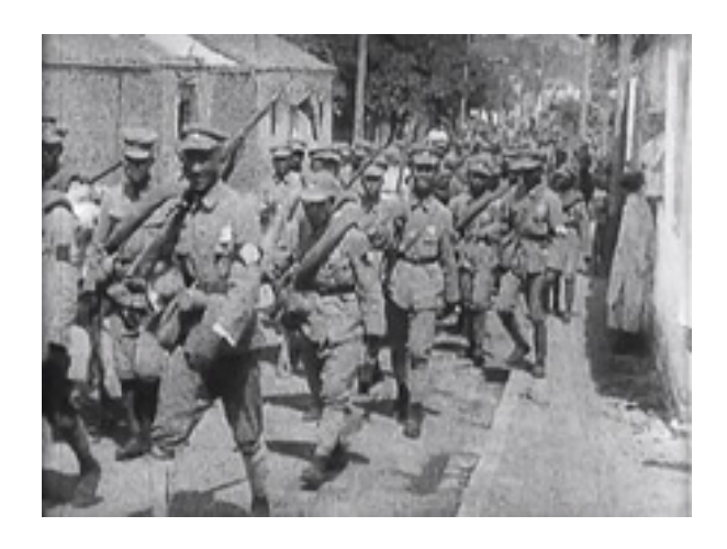
NRA soldiers marching

Finally, in late 1934, Chiang launched a fifth campaign that involved the systematic encirclement of the Jiangxi Soviet region with fortified blockhouses. Unlike previous campaigns in which they penetrated deeply in a single strike, this time the KMT troops patiently built blockhouses, each separated by about eight kilometres (five miles), to surround the Communist areas and cut off their supplies and food sources.